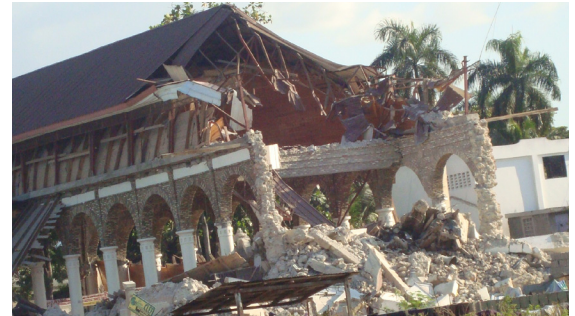
The remnants of St. Rose Church in Leogane.