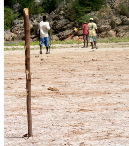
NDHP staff surveying the proposed site for the salt ponds

With this money, the project on the island of La Gonave will begin construction on the first of the Notre Dame salt ponds as soon as possible. This will bring much needed relief to the village of Picmi, where the ponds are to be located, in the form of both jobs and female empowerment. Women will be the primary workers doing the salt harvesting.